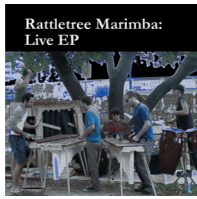
Rattletree's Live EP Released June 2007